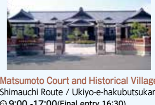
Matsumoto Court and Historical Village Shimachi Route / Ukiyo-e-hakubutsukan 9:00 - 17:00(Final entry 16:30) Adults: 410 yen, ages 6-15: free Adults: 310 yen, ages 6-15: free Every Monday (open and closed the following day if it's a holiday)/Around New Year's Day TEL.0263-47-4515