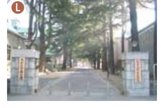
Agatanomori Park East Route / Agatagaokakoko