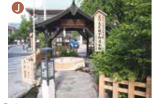
Genchi Well East Route / Hakarishiryokan