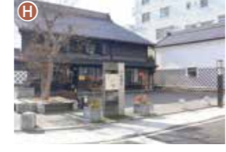
Nakamachi-Kurashikku-kan East Route / Kurashikku-kan 9:00 - 17:00 @Free Around New Year's Day 20 min TEL.0263-36-3053