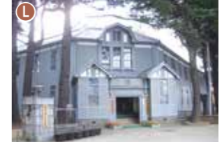
Former Matsumoto High School (Important Cultural Property) East Route / Kyu Matsumotokoko 9:00 - 22:00 (Sun. -17:00) @Free Holidays (Except for ones on Sunday,)/ Mondays (Closed even the following day if Monday is a national holiday or a substitute holiday)/Around New Year's Day 30 min TEL.0263-32-1812