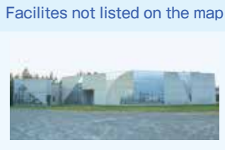
The Japan Ukiyo-e Museum Shimachi Route / Ukiyo-e-hakubutsukan 10:00 - 17:00(Final entry 16:30) Adults: 1,000 yen, over 13 with a valid student ID: 500 yen, 12 and under: free Adults: 900 yen, over 13 with a valid student ID: 400 yen, 12 and under: free Mondays (open and closed the following day if it's a holiday)/Around New Year's Day (temporarily closed when changing exhibitions) TEL.0263-47-4440