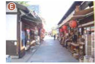
Nawate St. North Route / Daimyocho

Hours 營業時間 운영 시간 Admission fee 門票費用 요금 Closed 休館日 휴무일 Estimated time spent here 預計參觀時間 預計遊覽所需時間 코스 소요 시간 Discounted fee with the Town Sneaker One-day Pass (* Show your One-day Pass at the admission counter) 出示町遊巴士一日通票可享優惠票價 (*請於售票處出示您的一日通票) 타운스니커 1일권 소지 시 할인 요금 (*장구에 1일권을 보여주세요)