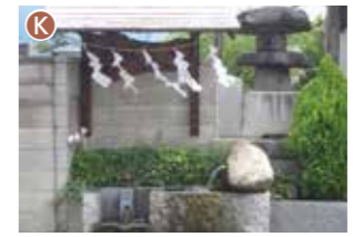
Iori Reisui (well) East Route / Iorireisui